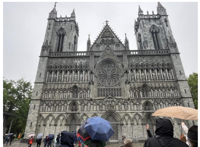
Nidaros Cathedral in Trondheim