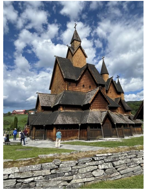
Heddal Stav Church