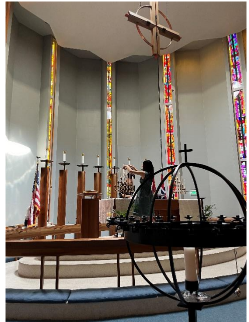
American Lutheran Church in Oslo