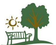
Worship in the Park

On Sunday, August 7 , we'll be MOVING our worship service from the friendly confines of 1020 State St. to the Spearfish City Park off of Canyon St. We'll gather at the big picnic shelter near the band shell at 10:00 A.M. ( note the time change from our normal 9:00 a.m. worship time )